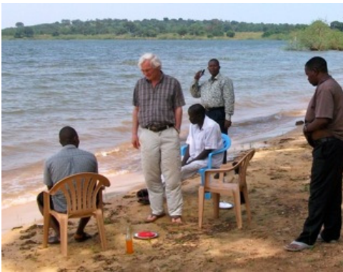
Time to chat by the Lake

The team had a highly productive time together at a peaceful retreat centre on the shores of Lake Victoria.