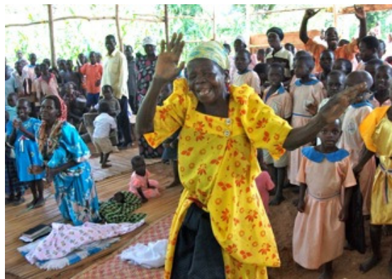
Joy at Kaiti!

Kaiti was first. Following our visit in 2010 we had given some land and financed the building of a church. As we arrived the whole of the church rushed out to greet us cheering and whooping in the way only Africans can! Many pastors were there testifying of their new found unity and of their on-going joint evangelistic work. A former drunk who had come to the Lord early on in