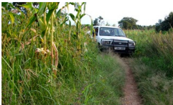
Road to Buliro

Wrenching ourselves away from these wonderful people, we then drove for many more hours