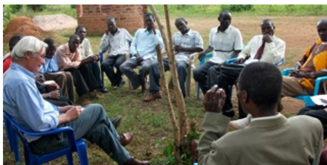
Taking notes of the wonderful stories from the pastors at Luguloire

Heading now back westwards in the pick up along pot holed country roads we then reached Luguloire our third destination. There waiting for us were a group of eighteen pastors all testifying of their new unity and of how they had been transformed by the training given.